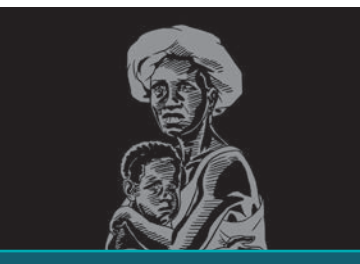
Feb. 17 | 5PM

On the morning of the rare Purple Moon ceremony, a young priestess awakens from a disturbing dream reenacting the fateful slave shipwreck that brought her ancestors.