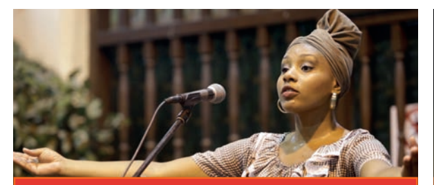
Feb. 16 | 1PM | CARLTON CINEMA