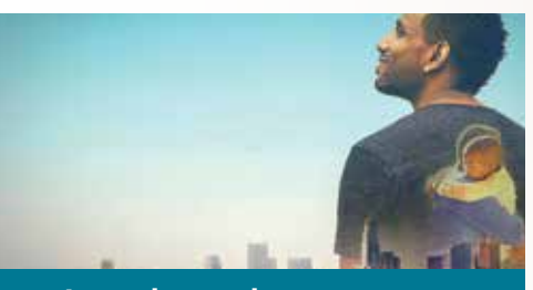
Feb. 18 | 5PM | CARLTON CINEMA

Katutura follows several characters experience the gravity of living in a Township where dreams are poised to die. As they remain hopeful in the face of adversity they are unaware their lives will collide in both hopeful and brutal ways.