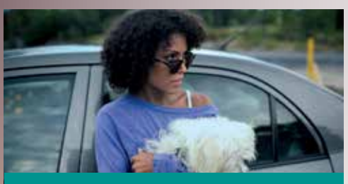
Feb. 19 | 3PM | CARLTON CINEMA